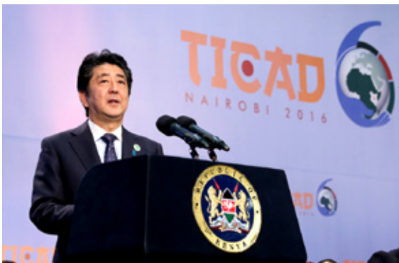
Prime Minister Abe delivers the keynote speech at TICAD VI.

public-private collaboration. The leaders and other senior officials of African countries had active discussions on responding to the new challenges that Africa faces, such as declining international resources prices, Ebola virus disease outbreaks and the fragility of the health system, and threats to peace and stability. Based on these discussions, the Nairobi Declaration was adopted.