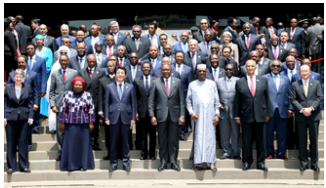
TICAD VI delegates including Prime Minister Abe come together for the commemorative photograph.