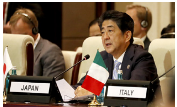
Prime Minister Abe speaks during the plenary session of the ASEM Summit Meeting.