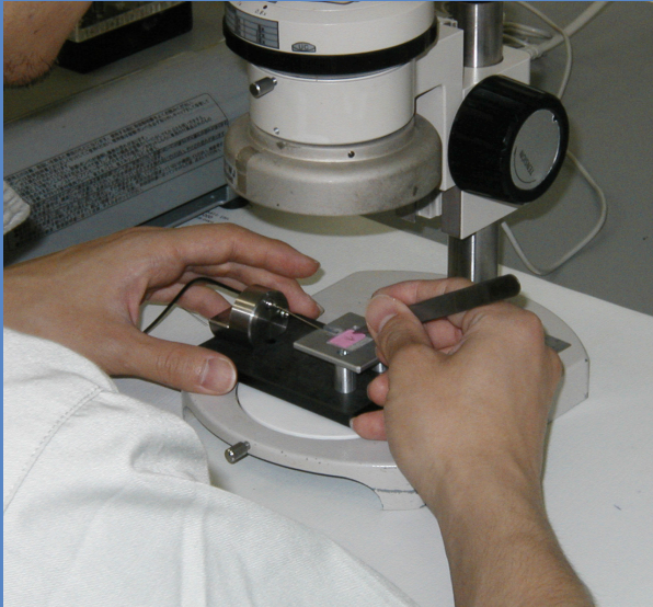
Kono Seisakusho's veteran machinists craft ultrafine needles just 30 micrometers in diameter and 800 micrometers long by hand