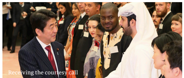
Receiving the courtesy call

On January 20, Prime Minister Abe received a courtesy call at the Prime Minister's Office from representatives of the Ship for World Youth Leaders, which is part of the Next Generation Global Leaders Program FY2015. Prime Minister Abe offered his wishes that the experience would be a precious asset for all of their futures, and that they would utilize it to fulfill roles as youth leaders in their respective countries.