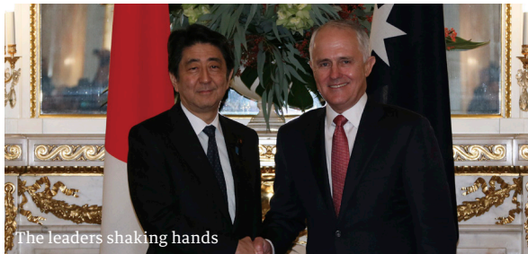
The leaders shaking hands

On December 18, Prime Minister Abe hosted a summit meeting and other events for the Hon. Malcolm Turnbull MP, Prime Minister of the Commonwealth of Australia, at the Akasaka Palace State Guest House and elsewhere. First, the two leaders held a meeting in a tearoom at the Urasenke Tokyo Branch. Next, at the Akasaka Palace State Guest House, the two leaders received a salute and attended a ceremony by the guard of honor and then held a summit meeting. Following this, the leaders made a joint statement to the press.