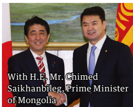
With H.E. Mr. Chimed Saikhanbileg, Prime Minister of Mongolia