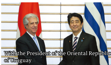
With the President of the Oriental Republic of Uruguay

On November 6, Prime Minister Abe hosted a summit meeting with H.E. Dr. Tabaré Ramón Vázquez Rosas, President of the Oriental Republic of Uruguay, at the Prime Minister's Office.