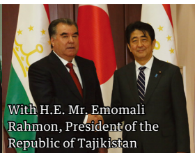
With H.E. Mr. Emomali Rahmon, President of the Republic of Tajikistan