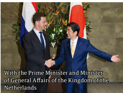
With the Prime Minister and Minister of General Affairs of the Kingdom of the Netherlands

On November 10, Prime Minister Abe hosted a summit meeting and other events with H.E. Mr. Mark Rutte, Prime Minister and Minister of General Affairs of the Kingdom of the Netherlands, at the Prime Minister's Office.