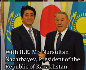
With H.E. Mr. Nursultan Nazarbayev, President of the Republic of Kazakhstan

From October 22 to October 27 (local time), Prime Minister Abe attended summits in Mongolia, Turkmenistan, Tajikistan, Uzbekistan, the Kyrgyz Republic and Kazakhstan. This represented the first visit to Turkmenistan, Tajikistan and the Kyrgyz Republic of a sitting Japanese prime minister.