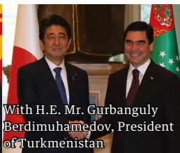
With H.E. Mr. Gurbanguly Berdimuhamedov, President of Turkmenistan