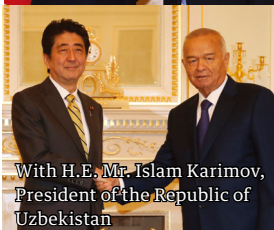
With H.E. Mr. Islam Karimov, President of the Republic of Uzbekistan