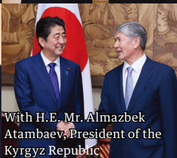
With H.E. Mr. Almazbek Atambaev, President of the Kyrgyz Republic