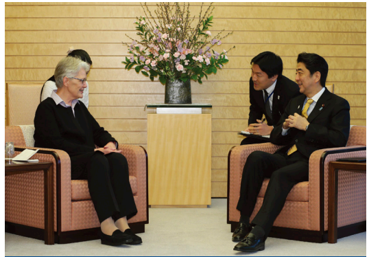
Prime Minister Abe with Ms. Margareta Wahlström

"Furthermore, Sendai, where the conference will be held, was also one of the areas affected by the Great East Japan Earthquake, and I hope to share with the world the progress of reconstruction from the disaster-affected areas."