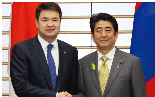
Prime Minister Abe with H.E. Mr. Chimed Saikhanbileg

Prime Minister Abe congratulated Prime Minister Saikhanbileg on his appointment as Mongolia's leader in November last year, and welcomed this visit to Japan, which is Prime Minister Saikhanbileg's first foreign visit since his appointment. Prime Minister Saikhanbileg began by expressing his condolences over the Japanese nationals who lost their lives in a hostage incident in Syria. He said that Mongolia supports and appreciates the Abe Cabinet's counterterrorism efforts and its humanitarian support for countries in the Middle East.