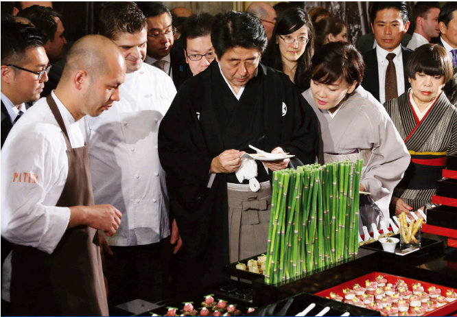
Attending a reception with the First Lady

FROM September 21 to 26 (local time), Prime Minister Shinzo Abe visited New York in the United States of America to attend the 69th General Assembly of the United Nations (UN).