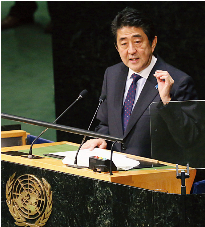
Delivering an address during the UN General Debate

On the fifth day, the Prime Minister met with U.S. Vice President Joe Biden at a hotel in New York.