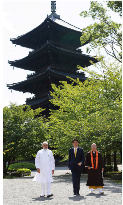
Walking through the grounds of Toji Temple

* Toji Temple is a Buddhist temple of the Shingon sect in Kyoto that is famous for its five-story pagoda, which is the tallest wooden tower in Japan. UNESCO designated the temple a World Heritage Site in 1994.