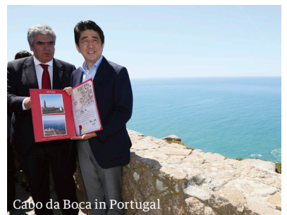
Cabo da Roca in Portugal