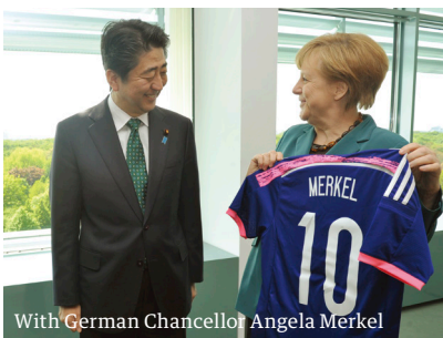
With German Chancellor Angela Merkel

“DURING this mission, I have visited six European nations that share with us fundamental values such as freedom, democracy, the rule of law and human rights, and which also have major influence in shaping international opinion. Focusing on the economy and security, I gained the understanding of the leaders of each of these nations regarding my policies and also successfully reached agreement with them on the further deepening of our cooperative relations,” said Prime Minister Abe at the press conference during his visit to Europe.