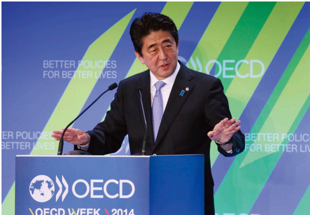
A keynote address at the OECD Ministerial Council Meeting