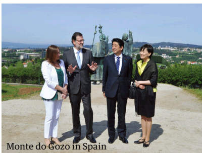
Monte do Gozo in Spain