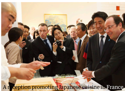
A reception promoting Japanese cuisine in France