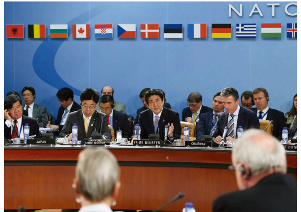
At the meeting of the North Atlantic Council

“DURING this mission, I have visited six European nations that share with us fundamental values such as freedom, democracy, the rule of law and human rights, and which also have major influence in shaping international opinion. Focusing on the economy and security, I gained the understanding of the leaders of each of these nations regarding my policies and also successfully reached agreement with them on the further deepening of our cooperative relations,” said Prime Minister Abe at the press conference during his visit to Europe.