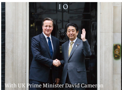
With UK Prime Minister David Cameron