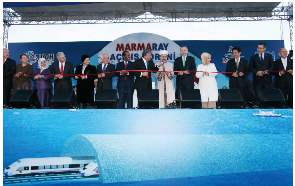
The Prime Minister cutting the ribbon at the opening ceremony of the Marmaray Project

Next year marks the 90 th anniversary of the establishment of diplomatic relations between Japan and Turkey. I want to conclude my remarks by hoping that this Rail Tube Crossing stretching over Bosphorus will truly become a symbol of friendship between Japan and Turkey, making the relationship between our two countries even closer, and that our bilateral relations will develop further.”