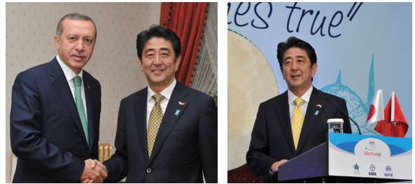
Left: Prime Minister Abe shaking hands with H.E. Recep Tayyip Erdoğan, Prime Minister of the Republic of Turkey Right: The Prime Minister delivering an address at the reception

“I have also heard that it would be nearly impossible to construct a tunnel at a depth of 60 meters along the base of the Bosphorus Strait. May I again express my respect for the strength of will